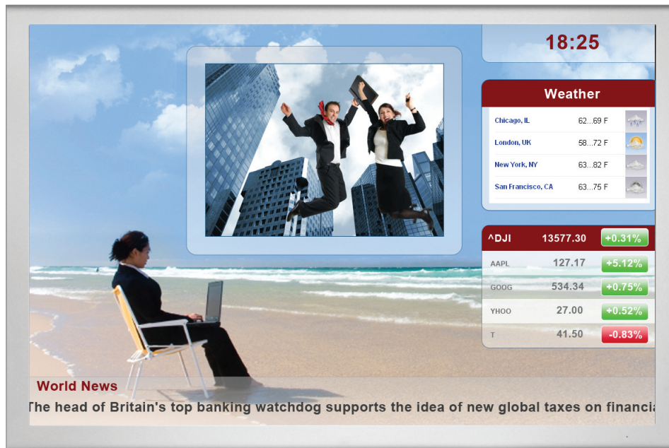
Figure 1. Content Overlay Example

When using a general-purpose processor for software-only decoding, GPUs are still used for many functions, including alpha layering, motion, rotation and sizing. Alpha layering is a means to post-process decoded content such as overlaying text or additional video tracks onto a video output. This is done by assigning each pixel a transparency variable, a value between 0 and 255, that is used to composite multiple layers of content, which is a fundamental capability for building eye-catching images. Giving the GPU more time for alpha keying, a general-purpose processor performing video decoding allows access to the decoded content up until the time it is sent to the display.