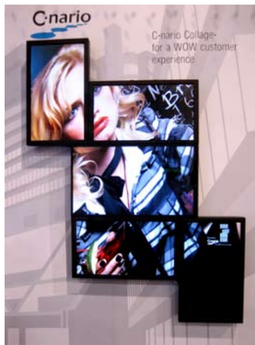
A multi-screen display can grab people’s attention, but it doesn’t have to break the bank.

“We can run any creative idea and put it on the screen without leaving