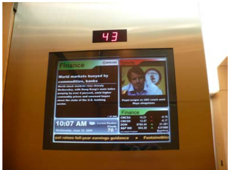
Philadelphia's Comcast Center deploys digital signage throughout its building, including the elevators.