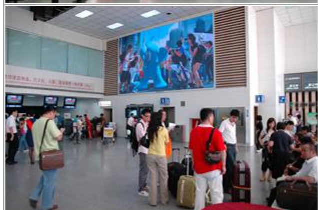
C-nario at Shanghai Airport