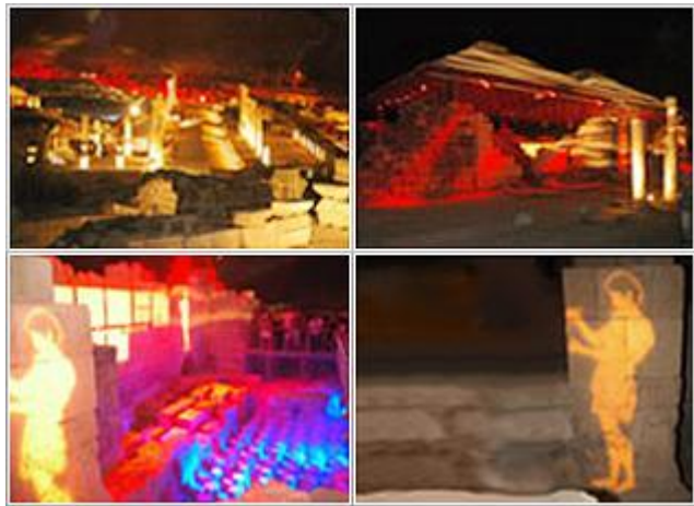
Reviving Ancient Scythopolis